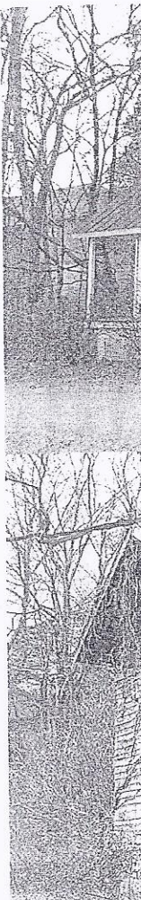
Above: The 18 Below: Smoke

The Quarterly also focused on a two-room outbuilding referred to as a servants’ quarters, noting that the National Register nomination described it as a “c. 1870